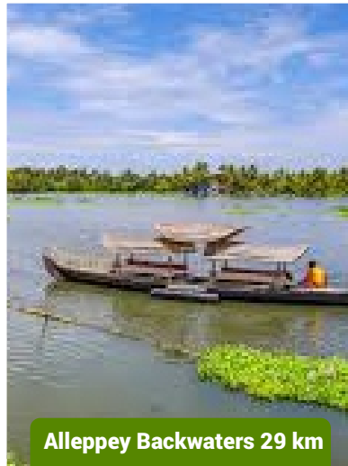
Alleppey Backwaters 29 km