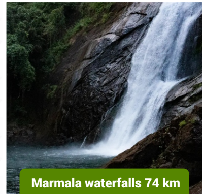
Marmala waterfalls 74 km