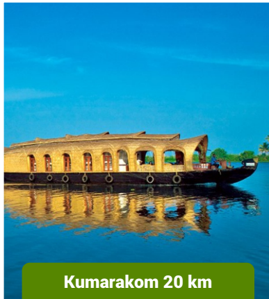
Kumarakom 20 km